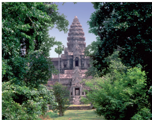
Temple at Angkor Wat, Cambodia

Day 17: Arrive U.S. We arrive in the U.S. and connect with our flights home.