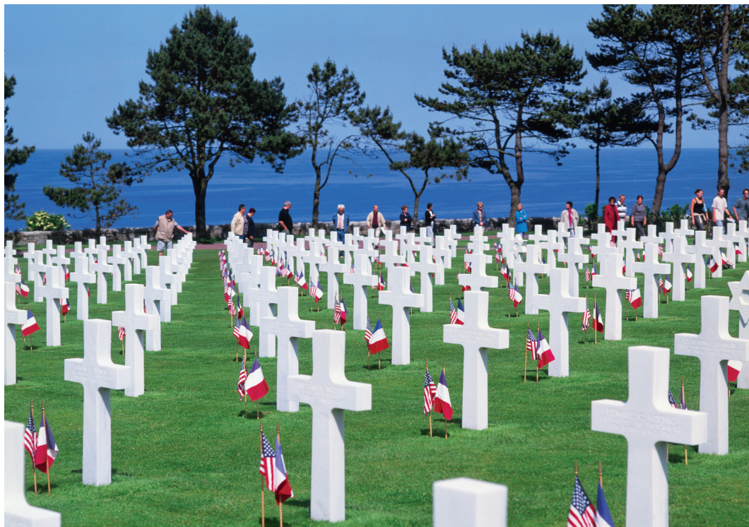
On Day 12, we visit the American Cemetery at Omaha Beach.

some of Sarlat's museums or art galleries – or simply to wander the atmospheric cobblestone streets. After lunch on our own we visit nearby Rocamadour, a revered pilgrimage site and medieval village whose three tiers cling almost impossibly to a sheer limestone cliff. We take a guided walking tour then enjoy some free time before we return to Sarlat mid-afternoon and dine together tonight. B,D