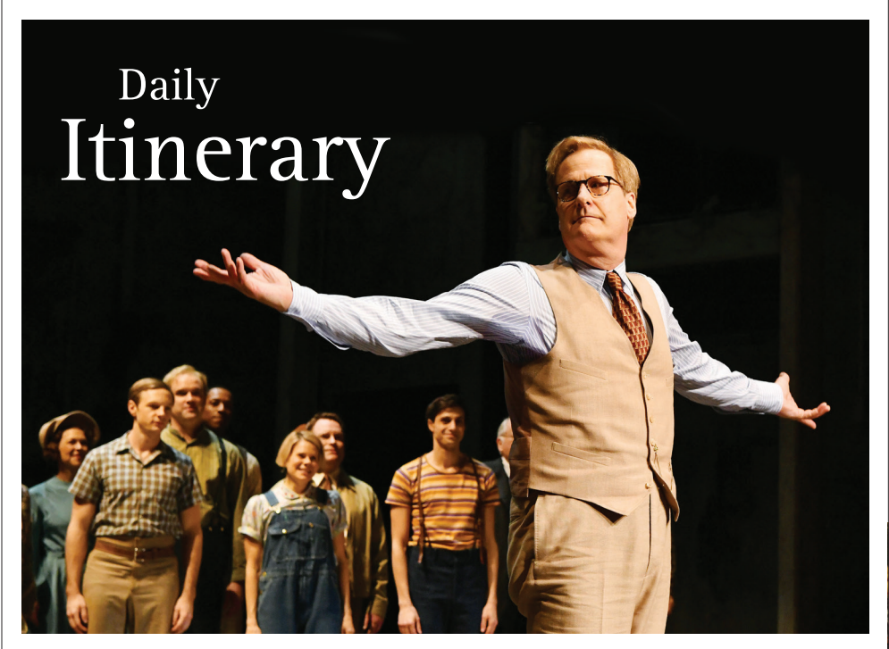
To Kill a Mockingbird